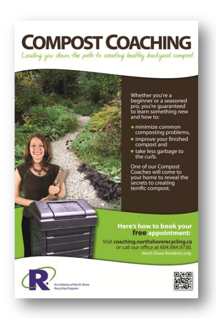
Poster for local garden shops and community centers

Compost Coaching was offered free to residents to remove any financial barriers to participation. To promote the program, the NSRP designed a poster that was placed in local garden shops and community centers, as well as an 8 cm promotion card that was given to residents who had asked for help with composting. The card had a direct link to their online booking page, which, in turn, provided easy access to all of their composting information and award-winning How-To videos. (Overcoming Specific Barriers; Prompts; Vivid, Credible, Empowering Communication)