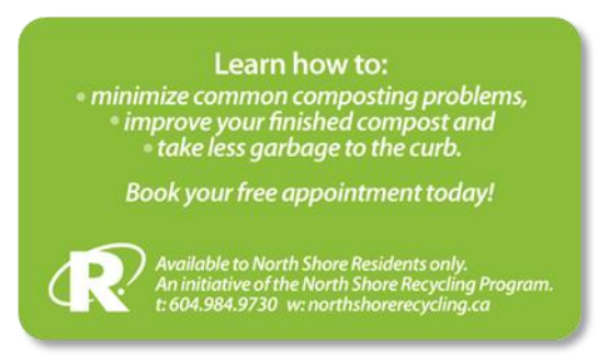
Promotion card with contact details

In addition, a promotion sticker was placed across the top seam of every compost box sold by the municipalities. (Prompt)