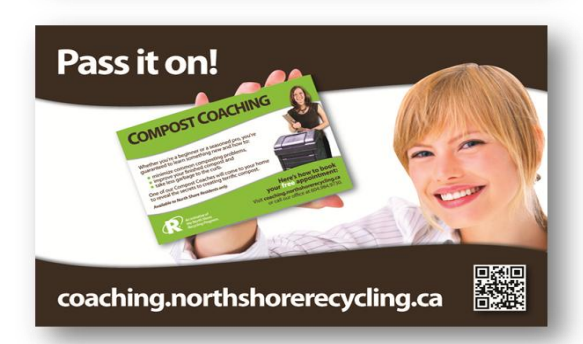
Pass-it-on Card, offering a free session